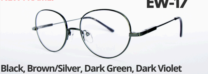
Black, Brown/Silver, Dark Green, Dark Violet